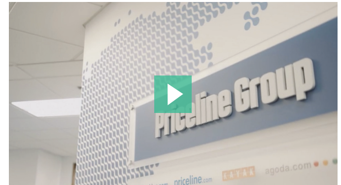
Hear about Priceline’s inspiring program for women, run by Everwise